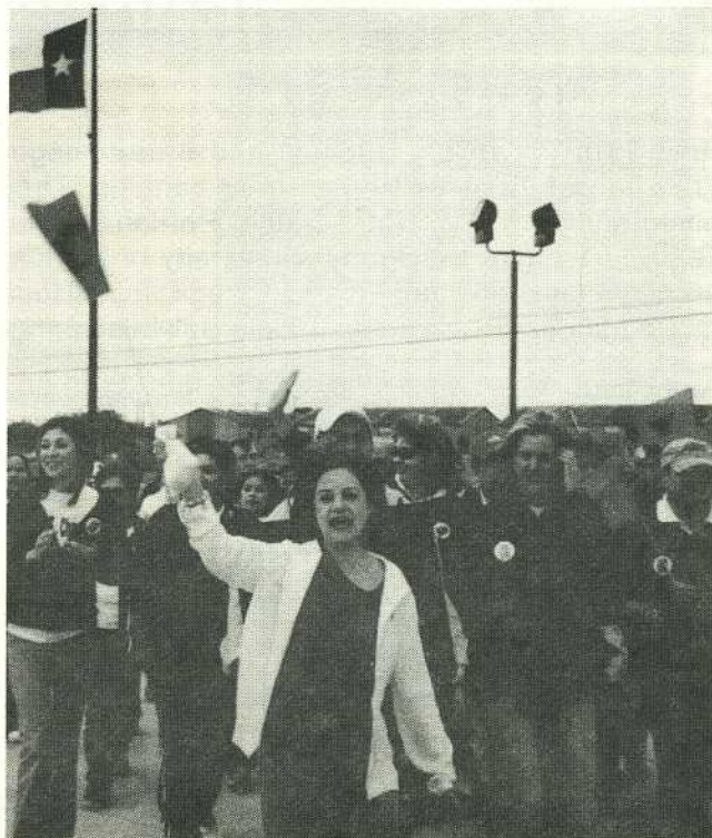
UT Pan Am students and local community members march in memory of Cesar Chavez in 2003.