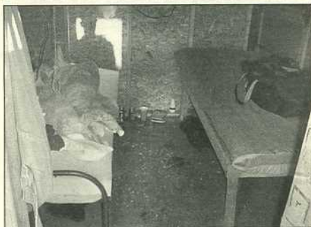
Examples of NC farmworker housing conditions.